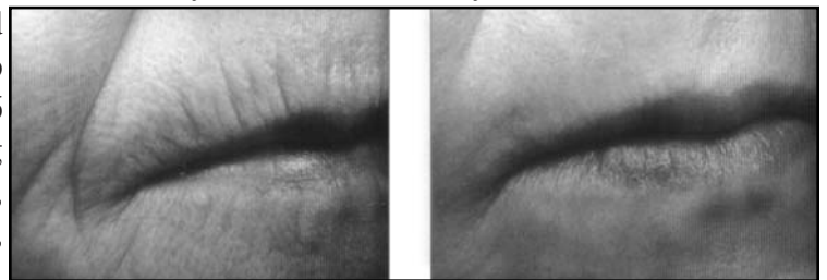
Female with wrinkles Before and 2 months after treatment

Take a look at the Referral Reward Program on the next page to find out how you can earn great gifts just for sending your friends a free gift of beauty. Because we'd much rather reward you than pay for expensive advertising or marketing. Thanks so much for thinking of our practice.